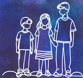
Children without Family Care

SPOON estimates that there are over 250 million of these children worldwide.