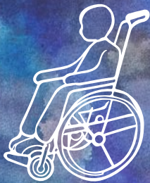
Children with Disabilities

SPOON serves children with disabilities & children without family care, two groups that are highly vulnerable to malnutrition.